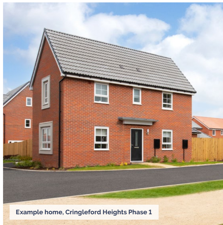
Example home, Cringleford Heights Phase 1

The site lies to the west of Cringleford and is directly adjacent to Phase 1 of Cringleford Heights. It forms part of the wider 28.7ha Newfound Farm site that is allocated in the Cringleford Neighbourhood Plan and benefits from an allocation in the Greater Norwich Local Plan. We are keen to hear what residents of Cringleford have to say about the proposals we are looking to bring forward.