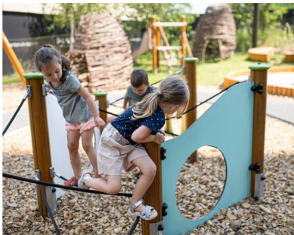
Image of previously developed home in Norwich, Norfolk at Barratt David Wilson Homes, Woodland Heath